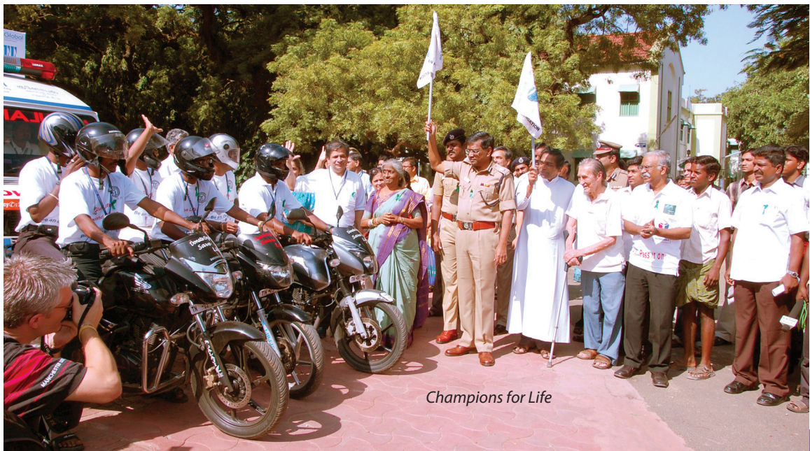
Champions for Life