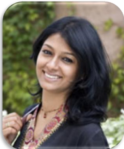
Actor & Director Ms. Nandita Das