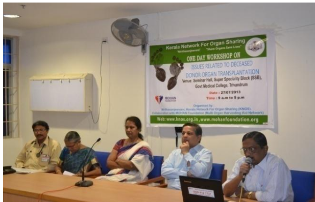
Workshop on Issues Related to Brain death - 27 th July 2013 - Trivandrum