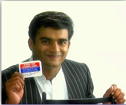
Mr. Madhavan, Actor