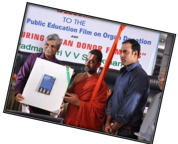
Padma Shri. V.V.S. Laxman, Cricketer