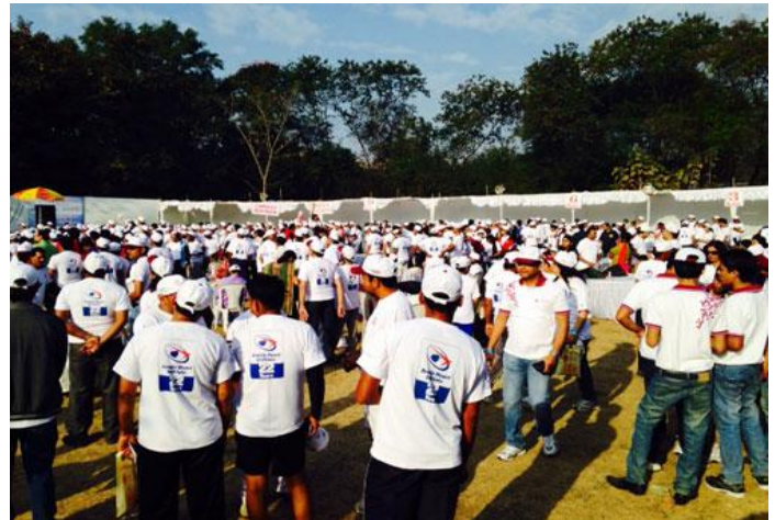
Participants gathering at the Walkathon to support for the cause

For the first time a stall was put up by the MOHAN Foundation in association with the Organ Donation Awareness Committee to create awareness about the importance of Organ Donation to save millions of lives. Staff of MOHAN Foundation manned the stall. Information pamphlets, information standees, pledge forms and donor cards prepared by MOHAN Foundation were placed in the stall.