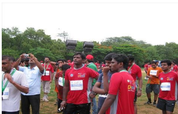
The participants after finishing 10 km Marathon