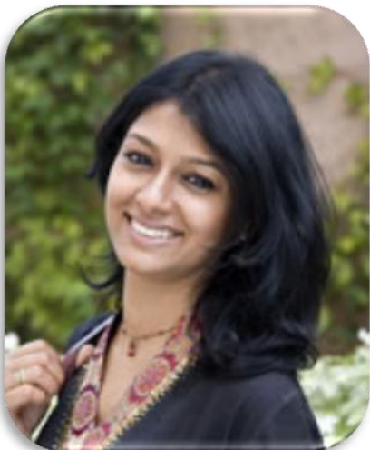
Actor & Director Ms. Nandita Das