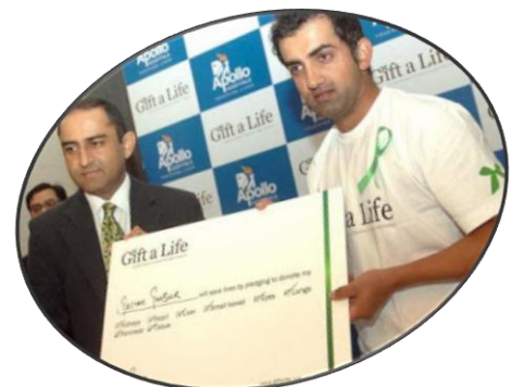
Mr. Gautam Gambhir, Cricketer