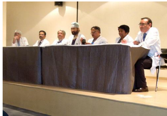
CME on Organ Donation - 12 th February 2014 - Medanta - The Medicity, Gurgaon