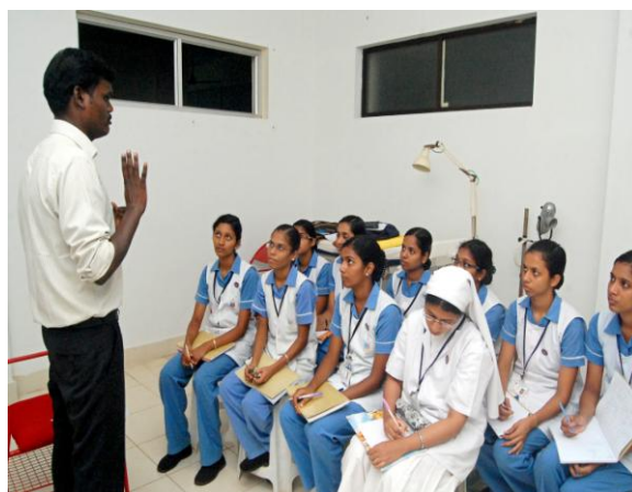
An interactive session on organ donation at Pondicherry Institute of Medical Sciences