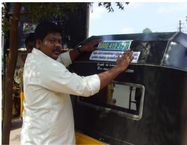
Promotion of the Organ Donation Helpline Number