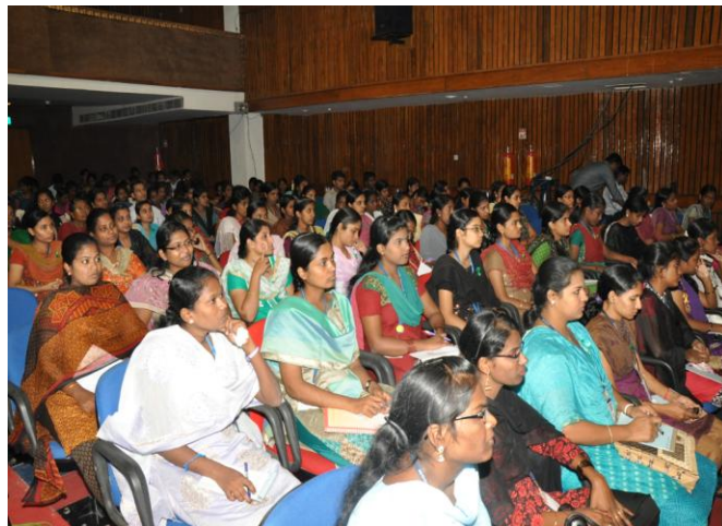
The participants at the program

The aim of the workshop was to impart knowledge on Organ Donation to nursing students. Around 350 participants attended the workshop, which included student nurses, staff nurses and nursing college faculty. 10 nursing colleges and 2 hospitals sent their staff and students to participate in this program.