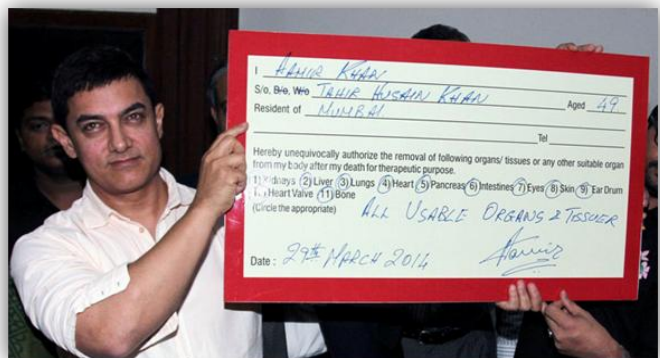
Mr. Aamir Khan - Actor & Director