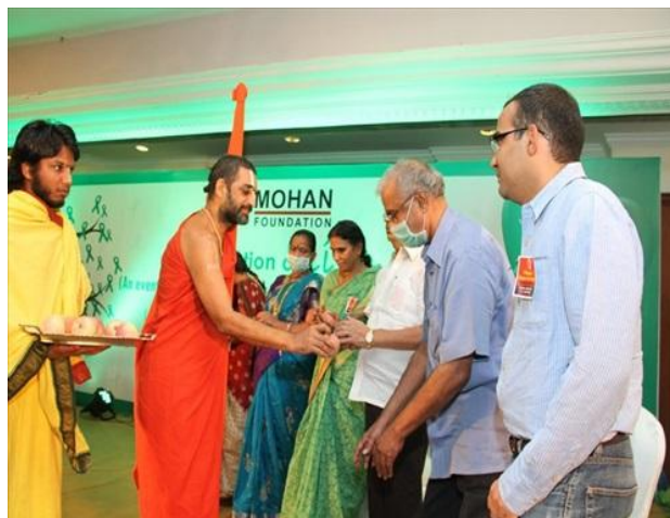
His Holiness Sri Sri Sri. Tridandi Chinna Jeeyar Swamiji blessing the transplant recipients

MOHAN Foundation, Hyderabad which began its journey in 2003, has completed 10 years in its continued endeavour at spreading the message about organ donation among a cross-section of our population. The 10 th anniversary event called “ Celebration of Life ” was held on 7 th April 2013 and celebrated the life and spirit of patients that underwent organ transplants during these 10 years. Several transplant patients shared their life-changing experiences.