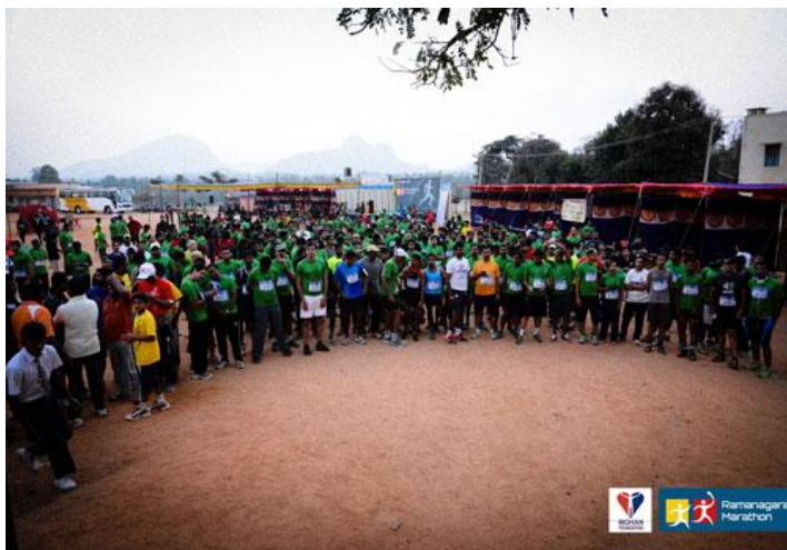
Participants ready to run for the cause

MOHAN Foundation and Yellow and Red Foundation organized an event to create awareness on Organ Donation on Sunday, 2 nd February 2014 at Ramanagara, Karnataka. Running categories were split into four - Spirit 10 km Run, Maja 5 km Run, Seniors 5 km Run and Students 5 km Run. Around 600 people participated in the Marathon. After the event there was a dance performance by the members of Shantala Charitable and Cultural Trust.