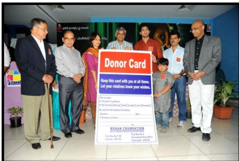
Ms. Amala Akkineni, Actor and Animal welfare activist