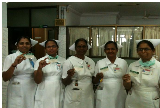
Senior Staff Nurses pledging the donor card at Rajiv Gandhi Government General Hospital,