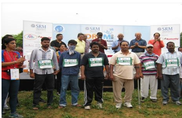
The transplant recipients participated in the Marathon

A cloudy sky and a slight drizzle did not hamper the enthusiasm of more than 2500 runners in the Dream Runners Half Marathon 2013 for the cause of organ donation on 7 th July 2013. Dream Runners and MOHAN Foundation organised a special 2.5 km run/walk for organ recipients as part of the half marathon. Eleven organ transplant recipients came forward to walk for 2.5 km to show their gratitude to their donors.