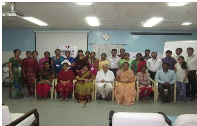
Participants of One Week Transplant Coordinators Training Program at Hyderabad

A One week Transplant Coordinators' Training Program was held at CARE Hospitals, Nampally, Hyderabad from 1st to 5th July 2013. The Training Program was partly supported by CARE Hospitals, Nampally. 18 participants from social work and nursing background attended the training program.