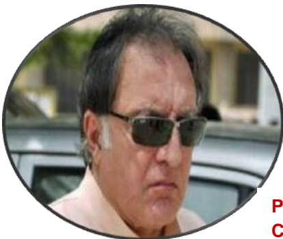
Padma Shri M. A. K. Pataudi Cricketer