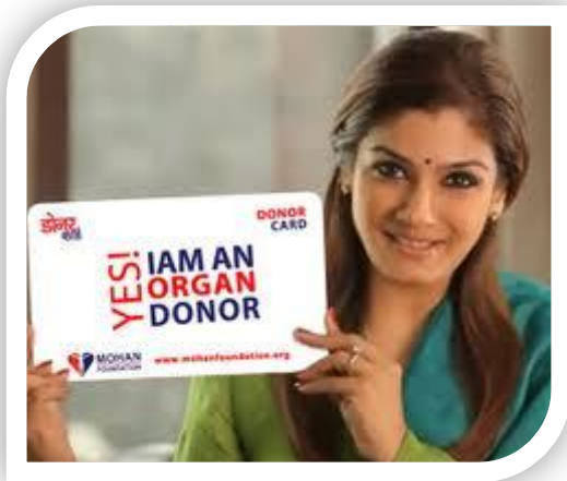
Ms. Raveena Tandon, Actor