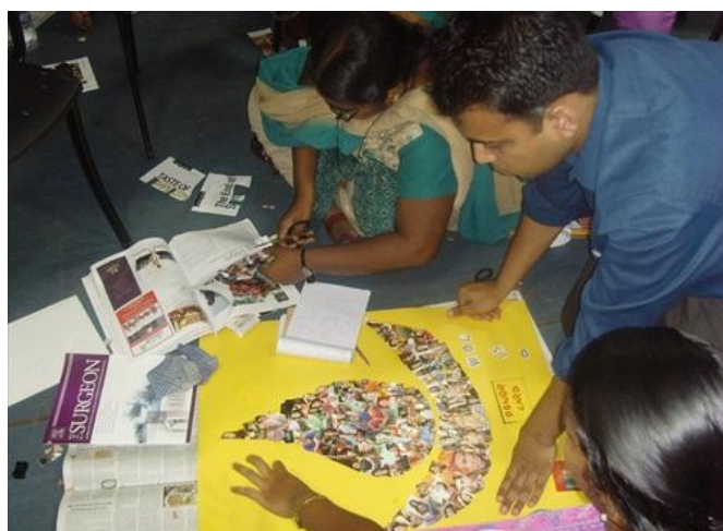
Group activity - preparing public education posters