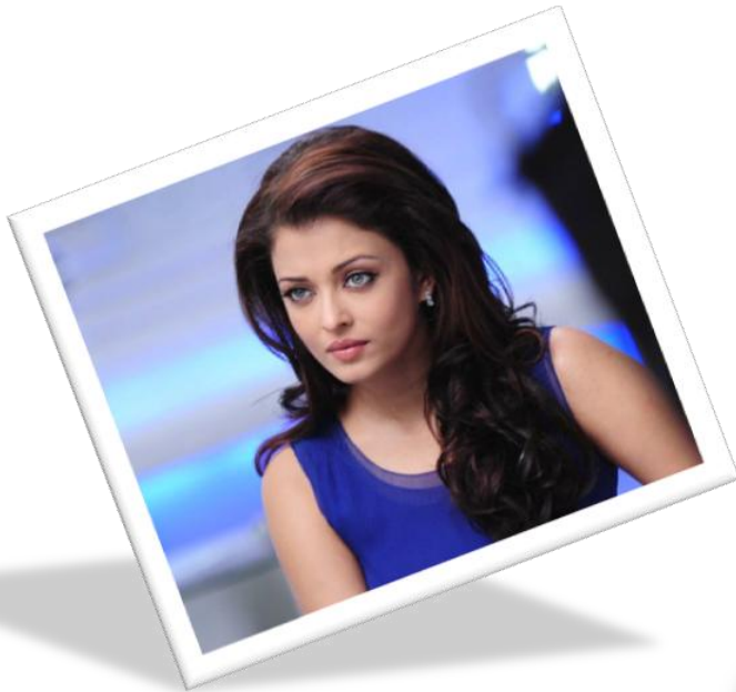
Ms. Aishwarya Rai Bachchan Former Miss World, Actor & Social Worker