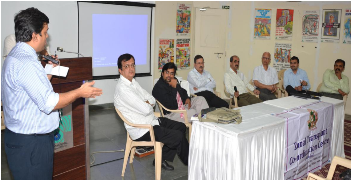
Brain Death and Deceased Organ Transplantation, 20 th July 2013, Lilavati Hospital, Mumbai