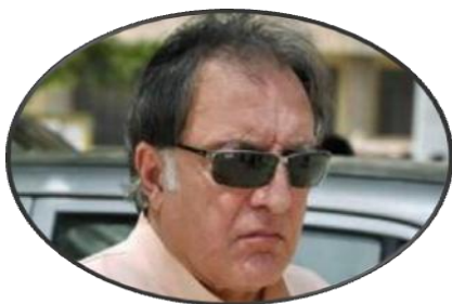
Padma Shri M. A. K. Patodi Cricketer