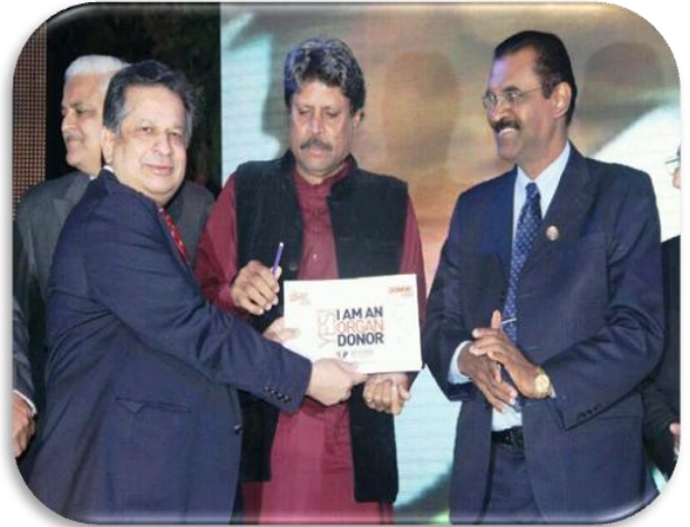
Padma Bhushan Kapil Dev, Cricketer