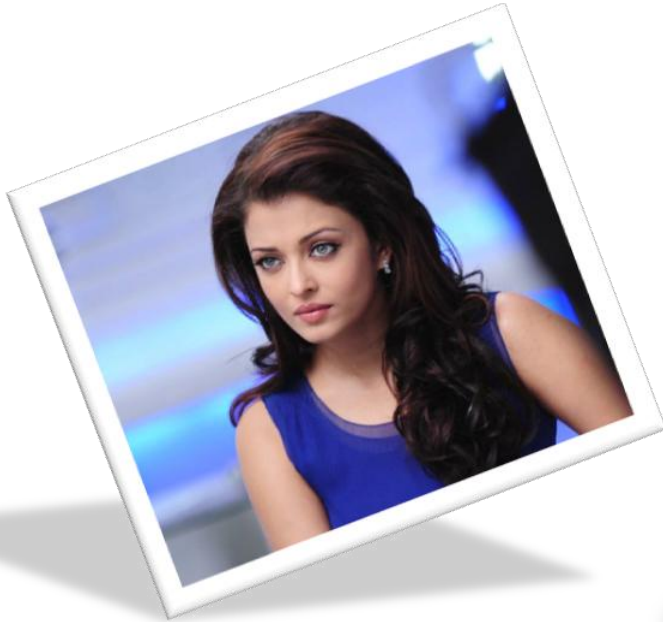
Ms. Aishwarya Rai Bachchan Former Miss World, Actor & Social Worker