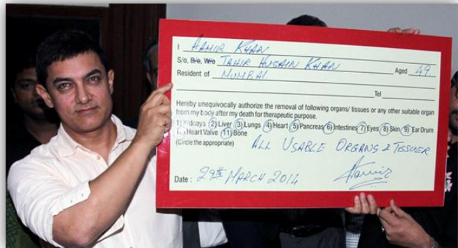
Mr. Aamir Khan - Actor & Director