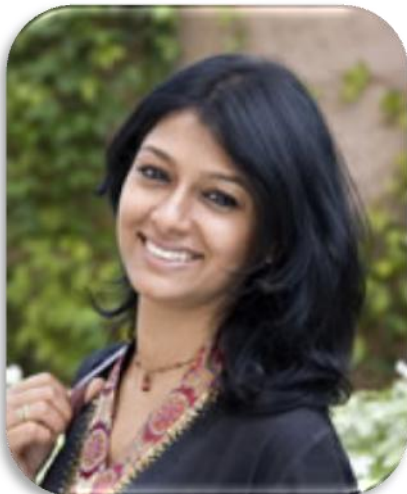
Actor & Director Ms. Nandita Das