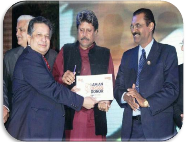
Padma Bhushan Kapil Dev, Cricketer