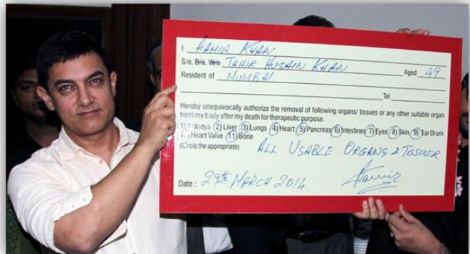
Mr. Aamir Khan - Actor & Director